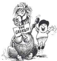
EXCESSIVE PRAISE OF YOUR PONY MAY SUGGEST THAT YOU ARE NOT USED TO SUCCESS